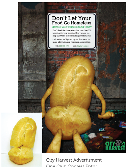
City Harvest Advertisement One Club Contest Entry