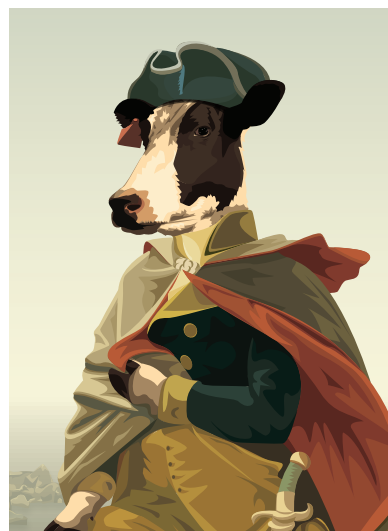
Illustration Contest Winner Animal Spots