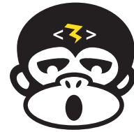
Threadspark Logo Concept This is Red Agency